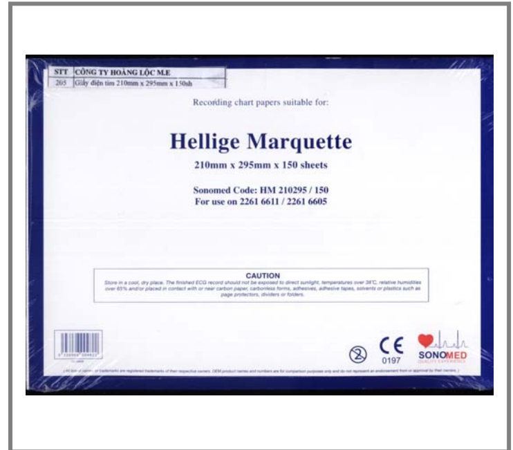
Giấy Điện Tim (210x295) 150 sheets

Since venturing into the industry in 1989, TELEPAPER has grown into a one-stop solution provider of office consumables well known in the market. Currently, we are a full-fledged corporation with business concerns ranging from paper products, imaging products, computer supplies and printing of paper rolls. Our main production lines are as follows: