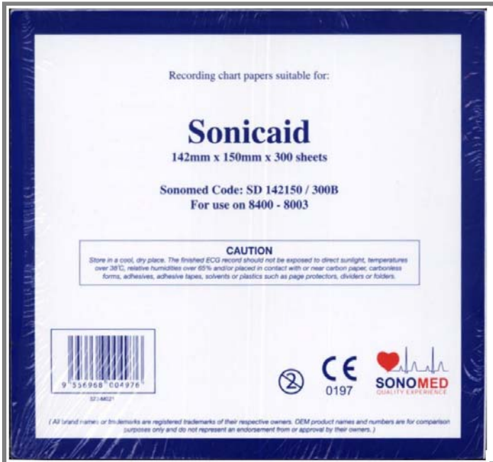
Giấy Điện Tim (142x150) 300 sheets