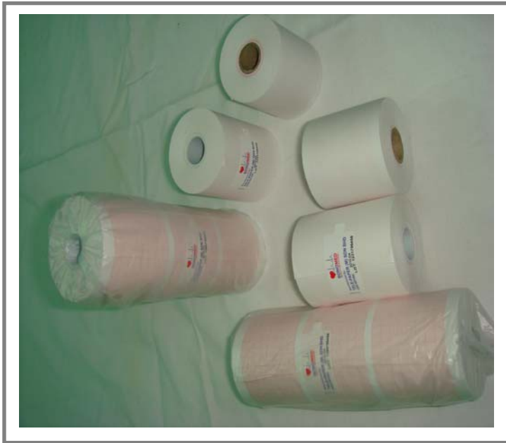
Giấy Điện Tim (50x30)

Nhà Phân Phối Độc Quyền Tại VN Các Sản Phẩm Giấy Y Tế TELE-PAPER (M) SDN. BHD. (Malaysia)