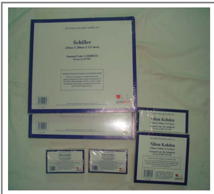
Giấy Điện Tim (210x280) 215 sheets