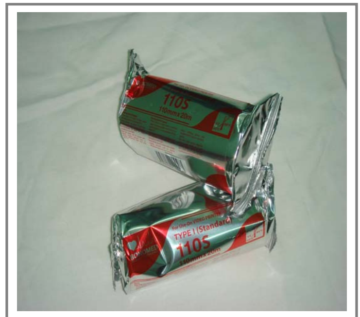
Giấy In Siêu Âm UPP 110S (110x20)