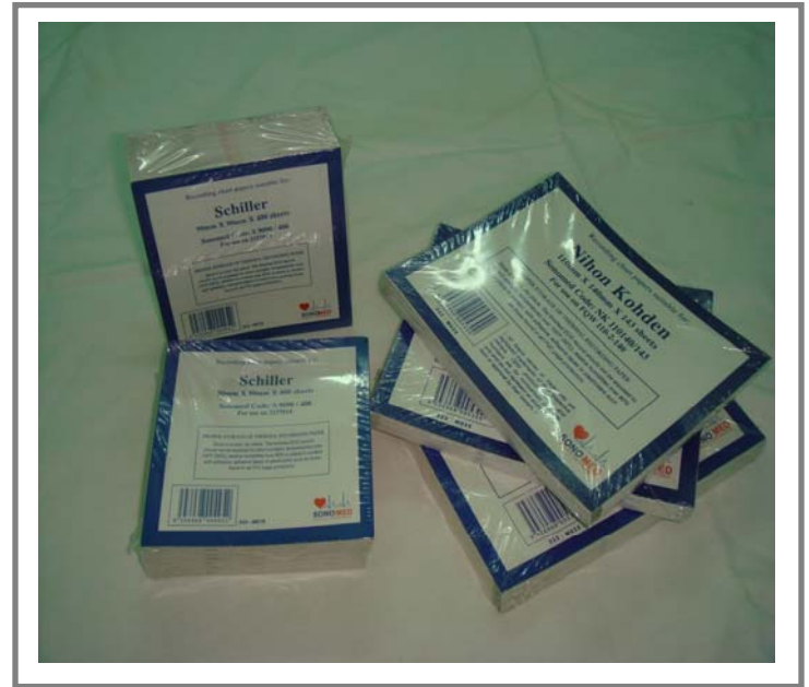
Giấy Điện Tim (90x90) 400 sheets